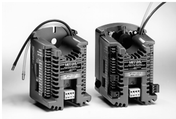
Figure 1: VMA1430 and VMA1410/1420 (1440 Not Shown)

Note: The VMA1440 is used exclusively as part of the Metasys Zoning Package. See the Metasys Zoning Package Product Bulletin (LIT-639050) for details.