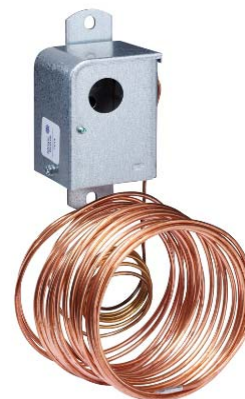
A11 Series Low Temperature Cutout Control