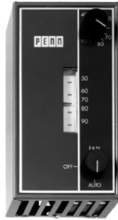
T22 Series Line Voltage Wall Thermostat