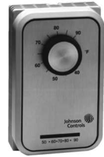
T26 Series Line Voltage Wall Thermostat