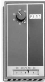
T25 Series Line Voltage Wall Thermostat